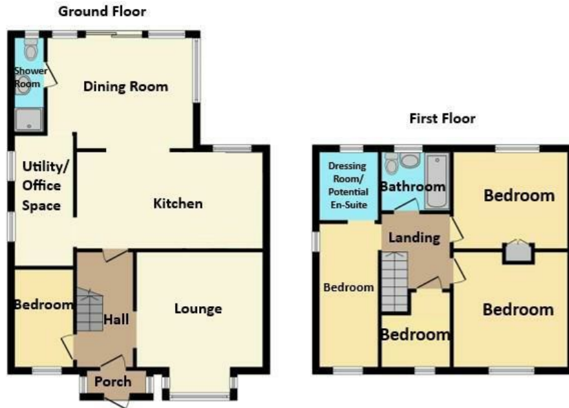
Total floor area 122.4 sq.m. (1,317 sq.ft.) approx

This floor plan is for illustrative purposes only. It is not drawn to scale. Any measurements, floor areas (including any total floor area), openings and orientation are approximate. No details are guaranteed, they cannot be relied upon for any purpose and they do not form part of any agreement. No liability is taken for any error, omission or misstatement. A party must rely upon its own inspection(s).